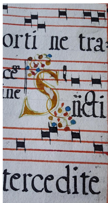
Il. 5. An example of intermodal expression in Antiphony , sygn, 3464, p. 130, MS Czart.

As stated before my research model proposal while dealing with multimodal artefact calls for interdisciplinary approach and intermodal tools, τα οργανα , to describe, define and interpret creative procedures applied by the manuscripts' scribes and painters. Thus I refer accordingly to specific analytical device depending on the moment of the examination, alternately be it words, picture or neums. Obviously when it comes to final data inferring one needs to choose which epistemology one sides as for ontic aspect of a single art. From one hand the latter contributes specifically into manuscript/antiphony production on its own, from the other, it adds to intermodal operis construction that in due course attracts human senses. With respect to data analysis and interpretation my epistemological both choice and belief is phenomenology.