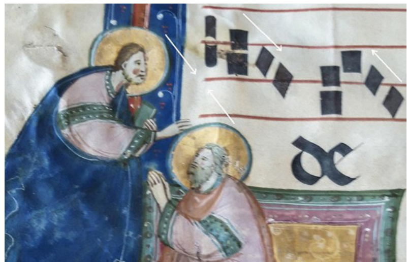
Il. 3B. Antiphonary , 14 th century, Sygn. 3464. MS Czart.

Another evidence corroborating suggested interrelatedness of the system of signs possessing equal semantic rights is datum 4, see below illustration 4. The fragment of antiphonary shows here an endeavour to render the idea of God through intermodal act of representation. The emphasis here is on the illuminated initial D in the word Deus . Not only it symbolizes the dynamics of divine creation through whirling sinusoidal spiral ( la spirale de croissance harmonieuse , Ghyka, 1998, p. 133) but overlapping with quadri-line stave it suggests as well that the picture and the word are of identical semantic status with music.