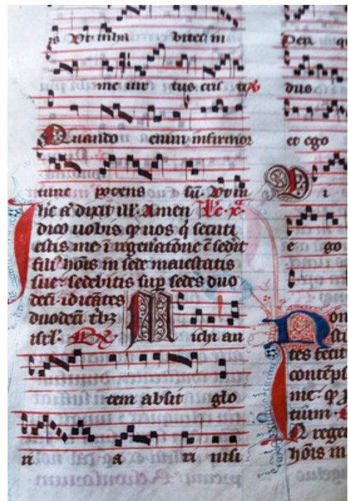
Il. 2. Antiphonary, 14 th century, France, Sygn 2147, Ms.Czart.