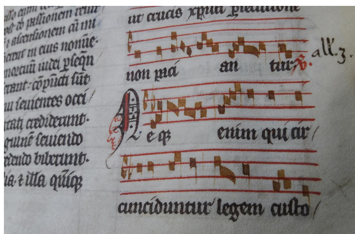
Il.1. De Sancto Stanislao antiphona. A hymn book. 15 th century, Sygn. IV 3608, Ms. Czart.