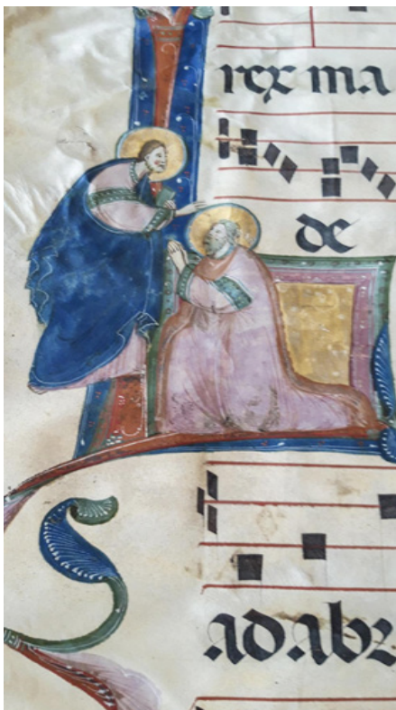
Il. 3A. Antiphonary , 14 th century, Sygn. 3464. MS Czart

The first one (Il. 3A, B) shows how a scribe presents the idea of hierarchy, here embodied in the interpersonal relation between two saints wearing a halo (originally a ring of light around the sun or moon here meant as a circle of light around the head of a holy person), one bending over another. The tension between the higher and the lower goes enhanced by the repercussion of this ethical-aesthetic traction in the sequence of notarum quadrātārum or neums just above the portrayed saints.