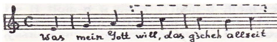
Figure 4. Fragment of Chorale „Was mein Gott will, das g’scheh allzeit” (Nosina, 1993, p. 24).

It is known that sometimes Bach did not use the beginning of the chant melody, but a fragment corresponding to a specific text. For example, you may notice that for him the melody from the chant „Was mein Gott will, das g’scheh allzeit” (What my God will, be done always), which coincides with the words: „will, das g’scheh allzeit” (be done always) (Fig. 4).