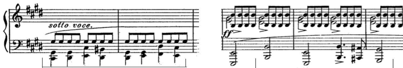
Figure 13. F. Chopin Prelude in D flat Major Op. 28 (fragments)

For each version of the theme from this chant, Chopin uses different expressive techniques of texture. Emotional state is underlined in music by using chant themes. This way “out of deep anguish” is portrayed with the usage of low register, where the melody in the bass is based on one version of the chant. “I call You” can be heard in the vibrant dynamics of octaves, representing the second version of the chant. It should be noted that the Polish translation forms the text of the chorale in the reverse order: „Z głębokiej potrzeby (out of deep anguish) wołam do Ciebie (I call You)”. Therefore, it is precisely this sequence of the meaning of the text that is conveyed by the composer in music (Fig. 13).