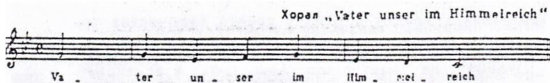
Figure 9. (Berchenko, 1993, p. 119)

Both themes are based on the intonations of the chant “Vater unser im Himmelreich” (Our Father in Heaven) (Fig. 9):