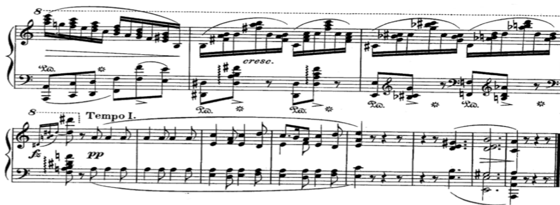
Figure 3. F. Chopin Ballade No. 2 in F Major Op. 38 (ending)

“Through its open jaws as the seas divide: so the youth and the maiden drown.” The end of Chopin’s Ballade almost exactly depicts the finale of a poetic narrative: “And still when the lake waters foam and roar, and still in the moon’s pale light, two shadows come flitting along the shore: the youth and the maiden bright” (Fig. 3).