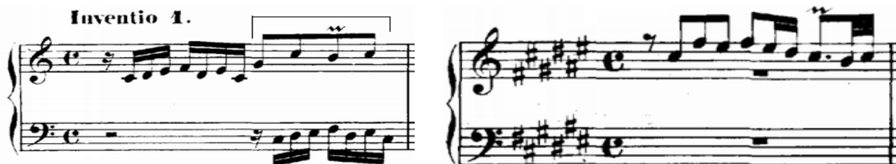
Figure 5. J.S.Bach Invention in C Major; WTK Book II Fugue in F # Major (fragments)

The implementation of this topic can be found in many themes of Bach’s works. For instance (Fig. 5):