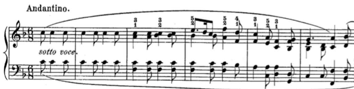
Figure 1. F. Chopin Ballade No. 2 in F Major Op. 38 (beginning)

One of the proposed works is Ballad No. 2 in F Major, Op. 38 (Fig. 1), which was written by the composer under the influence of the ballad by Adam Mickiewicz. One seems to hear in the music of the Ballade a certain display of the content of the poem "Świtezianka": "Who is the lad boy so comely and young, who is the maid at his side, who walk by the Świtez blue waters among the moonbeams that shine on its tide. A basket of raspberries she holds out; he gives her a wreath for her hair; the lad is her lover, and she is his sweetheart fair."