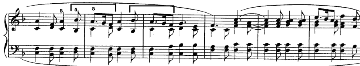
Figure 14. F. Chopin Ballade No. 2 in F Major Op. 38 (fragment)

If we return to the ballad, we will see that, in addition to the vivid musical “description” of the plot of Mickiewicz’s poem, sacred musical symbols are hidden in the melodies. They enhance the emotional impact on the listener and are a kind of musical prophecy of what will happen in the plot finale. At first, it can be noticed inside the serene melody at the beginning of the ballad, namely the downward tetrachord, mentioned above, as the theme of “crying” (Fig. 14).