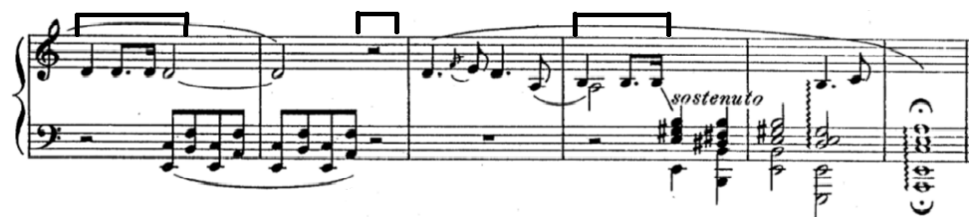
Figure 18. F. Chopin Prelude in A Minor Op. 28 (ending)

The rhythm of the funeral march, as well as the musical-rhetorical figure of aposiopesis (sudden breaking the music off), is a sacred symbol portraying death. Shortly after, the ripple of accompaniment disappears, giving place to the lone voice of a recitative melody. The Prelude ends with choral chords (Fig. 18).