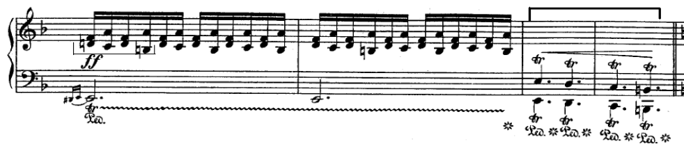
Figure 16. F. Chopin Ballade No. 2 in F Major Op. 38 (fragment)

The theme of “crying” is also heard in a series of trills that also seem to depict bubbling waters that killed the heroes of Mickiewicz’s poem. And tremolo in lower voices mimics the beginning of Dies Irae (lat., Lit. “the Day of Wrath”, meaning the Day of the Last Judgment) is a sequence in the Catholic Mass, one of the most popular Gregorian chants to this day (Fig. 16).