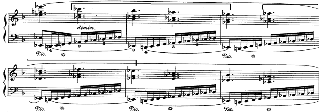
Figure 15. F. Chopin Ballade No. 2 in F Major Op. 38 (fragment)

The theme of “crying” is also heard in a series of trills that also seem to depict bubbling waters that killed the heroes of Mickiewicz’s poem. And tremolo in lower voices mimics the beginning of Dies Irae (lat., Lit. “the Day of Wrath”, meaning the Day of the Last Judgment) is a sequence in the Catholic Mass, one of the most popular Gregorian chants to this day (Fig. 16).