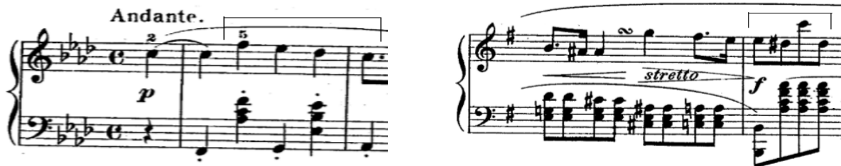
Figure 10. F. Chopin Nocturne in F Minor Op. 55 # 1 (beginning); Prelude in E Minor Op. 28 (fragment)

In the works of Chopin, one can often spot certain musical symbols of sacred meaning, used by Bach. For example, the ‘crying’ chant theme, four descending pitches, or tetrachord, is very often found in the works of the Polish composer. As well as four ‘crossed’ pitches, the musical gesture symbolising the cross (graphically, this theme resembles the cross: if the 1st and 4th sounds are connected, a horizontal line of the cross is formed, and if the 2nd and 3rd sounds are connected, a vertical line of the cross is formed) (Fig. 10).