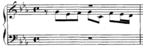
Figure 8. J.S. Bach WTK Book I Fugue in C Minor (fragment)

Both themes are based on the intonations of the chant “Vater unser im Himmelreich” (Our Father in Heaven) (Fig. 9):