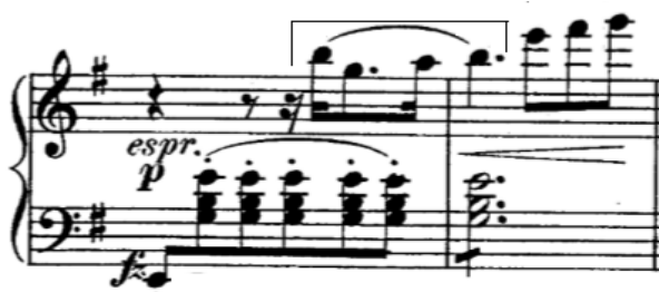
Figure 7. F. Chopin Concerto No. 1 in E Minor Op. 11 (fragment)

A peculiar dialogue between Bach and Chopin continues in the second central theme of the 1st part of the Concerto in E minor. This melody reminds the beginning of the fugue motive in C minor of J.S. Bach (Fig. 7, 8):