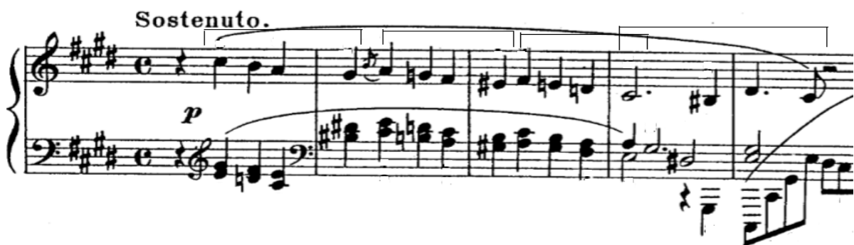
Figure 11. F. Chopin Prelude in C # Minor Op. 45 (beginning)

All these motives are significant to Chopin, who used them to enhance the emotional impact of music. Sometimes, both motives are used side by side and complement each other (Fig. 11).