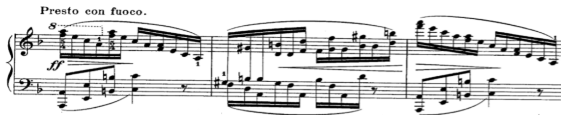
Figure 2. F. Chopin Ballade No. 2 in F Major Op. 38 (fragment)

“Through its open jaws as the seas divide: so the youth and the maiden drown.” The end of Chopin’s Ballade almost exactly depicts the finale of a poetic narrative: “And still when the lake waters foam and roar, and still in the moon’s pale light, two shadows come flitting along the shore: the youth and the maiden bright” (Fig. 3).