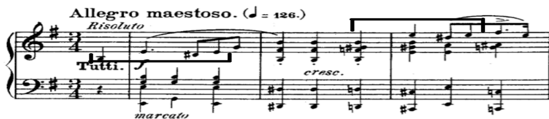
Figure 6. F. Chopin Concerto No. 1 in E Minor Op. 11 (beginning)

And it turns out that Chopin’s concerto in E minor, begins precisely with this motive (Fig. 6):