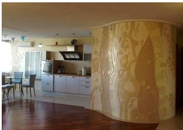
Fig. 1. The living room studio interior of the residential apartment, Kyiv, Ukraine. Relief panel "Ethnic motif". Designer: O. Zakutskya. Artists: A. Polubok, O. Pylypchuk. ( Decorative wall panel , 2003).

The example (Fig. 1) demonstrates the use of the compositional category in the space decision with the help of a fine art object. Due to the peculiarities of placement and scale ratio, the relief artistic and decorative panel emphasises and attracts the viewer's attention, which creates a single visual combination of two interior areas — the living room and the kitchen. Perception clarity and artistic appropriateness create visual comfort, and contribute to individual designing the space.