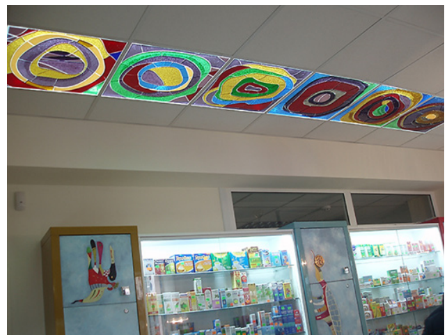
Fig. 2. Stained glass in a pharmacy of Kyiv, Ukraine. Designer: O. Zakutskya (The author's photo ( Gallery , n.d.)).

Fig. 2 shows an example in which art objects (stained glass) are used with a functional (utilitarian/aesthetic) aim, as artistic elements of lighting devices in the pharmacy decoration. Inspired by the work of V. Kandinsky "Blue Sky", abstract forms create associative images and allow the pharmaceutical establishment to attract attention and provide more visitors. Made in the style of fusing, stained-glass inserts perform the utilitarian function of colored lighting in addition to the aesthetic one.