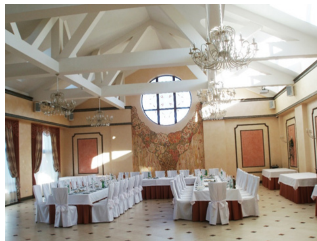
Fig. 4. Banquet hall of the "Staryi Mlyn" restaurant, p. Rakytno, Kyiv region, Ukraine. Designer: M. Butakova. Artist: O. Pylypchuk (the author's photo ( The mural , 2015)).

The example (Fig. 4) demonstrates the use of the "Art Nouveau" style in the artistic performance of the restaurant interior design, where the main task of the artistic design is to provide the characteristic stylistic features of this interior, which, in turn, helps to strengthen the general style of the place. Thus, one of the main goals is to create a stylistically expressive and visually attractive interior space in accordance with a chosen style.