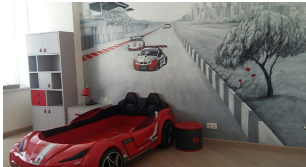
Fig. 5. Interior of a living room in Kyiv, Ukraine. Designer: O. Zakutska. Artist: O. Pylypchuk.

and genre of the painting (art work) corresponds to the theme of the interior, emphasising characteristic features of the space, and creating a complete and exciting image for children.