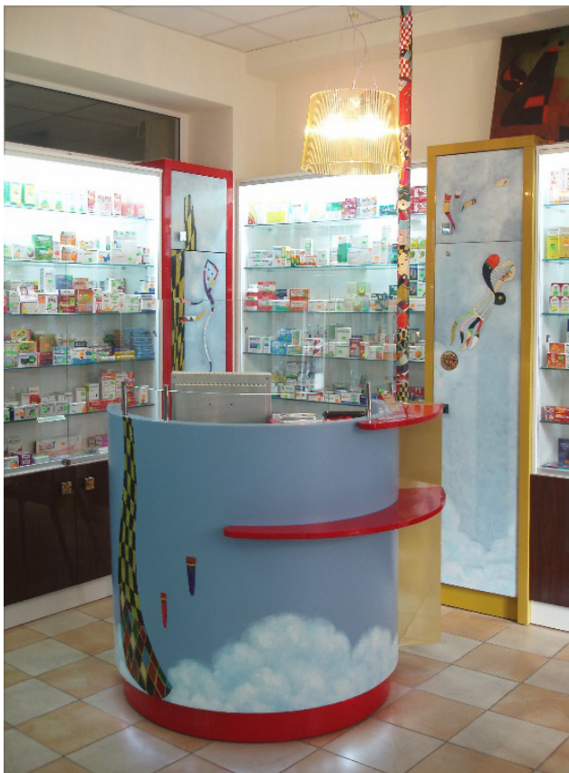
Fig. 3. Interior of a pharmacy in Kyiv, Ukraine. Designer: O. Zakutskya. Artist: O. Pylypchuk.

Fig. 3 demonstrates the use of non-standard material in a pharmacy where strict hygienic conditions are required. The artistic and decorative design is made using the "decoupage" technique and ecofriendly materials (paper, acrylic paints and fixing coating), which are resistant to operation, and meet hygienic standards. The unusualness of the used materials used in the functional equipment of the pharmacy makes it effective and comfortable for users.